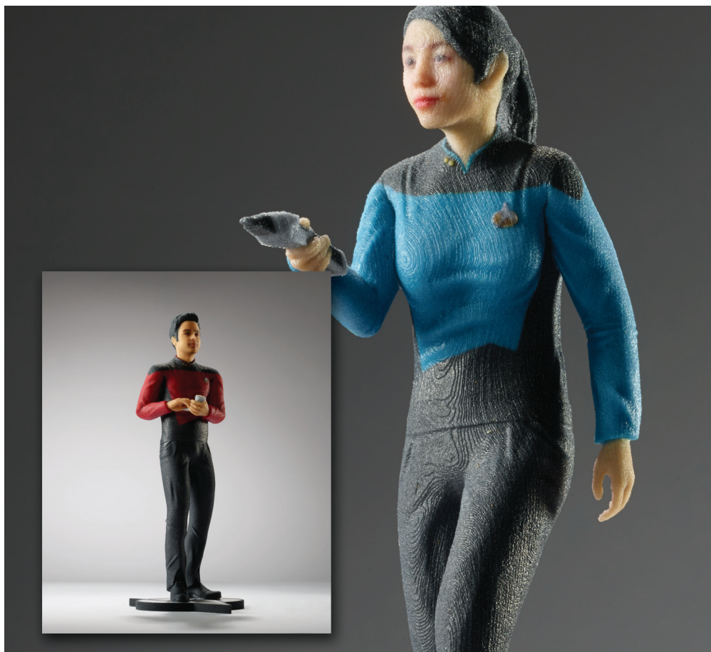
Figure 4. Example of photorealistic depiction of collectibles by Cubify