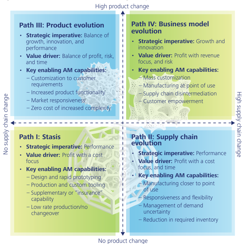
Figure 3. Framework for understanding AM paths and value

Graphic: Deloitte University Press | DUPress.com